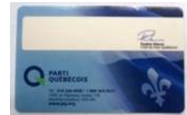
Laminated (Glossy finish)