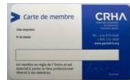
Polyester (matte finish)